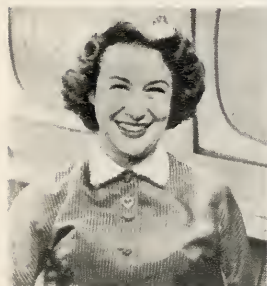
Here she is again as chief of Home show.